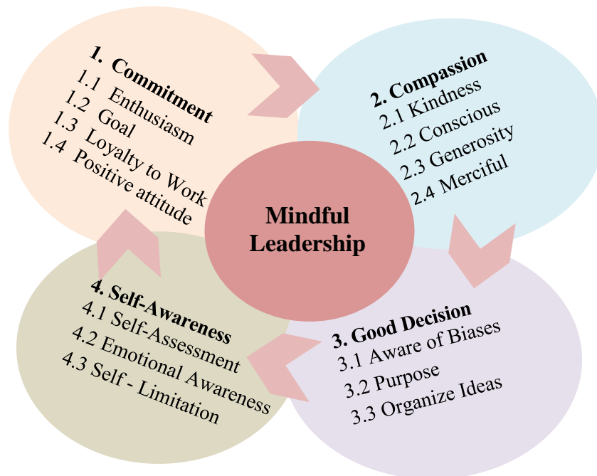
Figure 2. Administration Conceptual Framework for Mindful Leadership Development for Primary School Principals under the Office of the Basic Education Commission in Thailand (The figure was developed by the researchers)

However, the use of this research's results for further research or for the staff development should take into account that the key elements of this study were the result of 17 references; there are 34 theoretical key elements, but four were selected for this study due to their higher frequency. Even though some of the other 30 left elements were lower in frequency, they are worthy of researching. Examples include: continuing consciousness, positive force, staying present, emotional intelligence, lifebuoy, love mercy, modesty, staying focused, listening, paying attention to yourself, being careful, understanding the situation, having responsibility, good adaptability, creativity, holistic process, the need to reduce, agreeing with the participation, distance between thinking and doing, , having a good time, cultivating, uncleanliness one's influence on society, having courage, having patience, accepting failure, developing, innovating, preventing boredom, new generation leader, responding more than silence, having an open mind and not vulgar. Therefore, we suggest the researchers who are interested in the development of the mindful leadership indicators including the organisations that want to develop mindful leadership for their staff consider selecting those elements to use in the research or staff development as well.